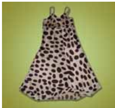
Model: CTA-009 Minimum order: 20 pieces per color per size Packaging type: Nylon bag, carton Delivery time: 30 days Indicated price: $20 Description: Dress; 100 percent silk satin; polka-dot pattern; size M