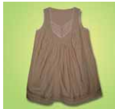
Model: CTA-901 Minimum order: 20 pieces per color per size Packaging type: Nylon bag, carton Delivery time: 30 days Indicated price: $20 Description: Hip-length top; 100 percent cotton; sleeveless; handembroidered front panel; decorative buttons; size M