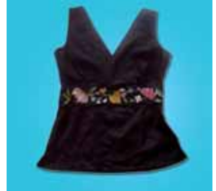
Model: CTA-005 Minimum order: 20 pieces per color per size Packaging type: Nylon bag, carton Delivery time: 30 days Indicated price: $18 Description: Blouse; 100 percent silk; sleeveless; front band features floral handembroidery; size M