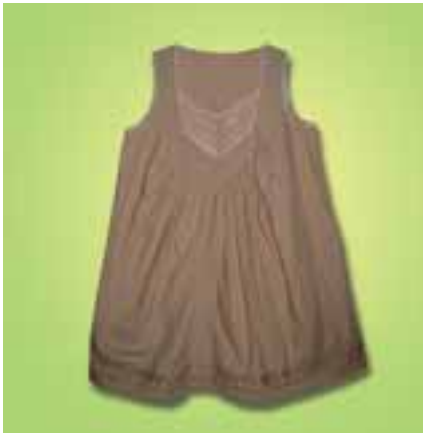
C&T (profile page 24) Model: CTA-901 Minimum order: 20 pieces per color per size Packaging type: Nylon bag, carton Delivery time: 30 days Indicated price: $20 Description: Hip-length top; 100 percent cotton; sleeveless; handembroidered front panel; decorative buttons; size M