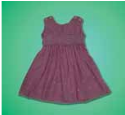
Model: CTV-110 Minimum order: 20 pieces per color per size Packaging type: Nylon bag, carton Delivery time: 30 days Indicated price: $7.50 Description: Girl's dress; 100 percent cotton; handsmocked; suitable for 3-year-olds