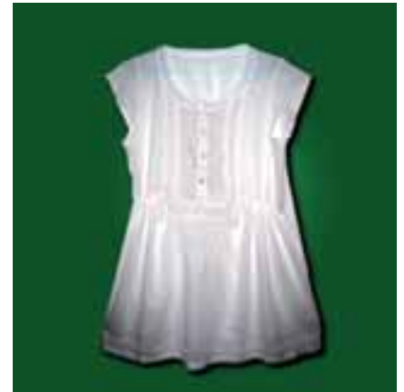
C&T (profile page 24) Model: CTA-903 Minimum order: 20 pieces per color per size Packaging type: Nylon bag, carton Delivery time: 30 days Indicated price: $20 Description: Dress; 100 percent cotton; sleeveless; four-button front closure; size M