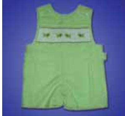
Model: CTV-111 Minimum order: 20 pieces per color per size Packaging type: Nylon bag, carton Delivery time: 30 days Indicated price: $7.50 Description: Children's romper; 100 percent cotton; sleeveless; suitable for 3-year-olds