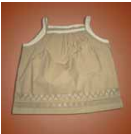
C&T (profile page 24) Model: CTA-904 Minimum order: 20 pieces per color per size Packaging type: Nylon bag, carton Delivery time: 30 days Indicated price: $20 Description: Camisole; 100 percent cotton; sleeveless; size M