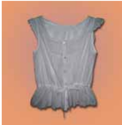
C&T (profile page 24) Model: CTA-902 Minimum order: 20 pieces per color per size Packaging type: Nylon bag, carton Delivery time: 30 days Indicated price: $20 Description: Blouse; 100 percent cotton; cap sleeves; handembroidered front trimming; drawstring at waist; size M