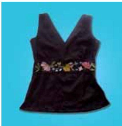
C&T (profile page 24) Model: CTA-005 Minimum order: 20 pieces per color per size Packaging type: Nylon bag, carton Delivery time: 30 days Indicated price: $18 Description: Blouse; 100 percent silk; sleeveless; front band features floral handembroidery; size M