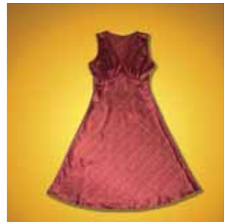
C&T (profile page 24) Model: CTA-006 Minimum order: 20 pieces per color per size Packaging type: Nylon bag, carton Delivery time: 30 days Indicated price: $20 Description: Dress; 100 percent silk satin; full-length; size M